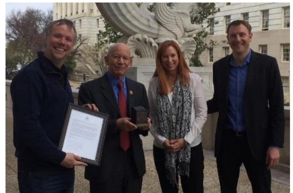
Representative Peter DeFazio receives award from Oregon Workforce Partnership leaders

This Workforce Champion Award was designed and manufactured in Oregon, where innovative 21st century skills were used to craft this award. Cannonball Media, a company based on Bend that specializes in high-quality 3D motion graphics, designed the award using stereo lithography 3-dimensional modeling. Jeld Wen, one of the world's leading manufacturers of reliable windows and doors, converted the 3D model to a solid form, then utilized a 3D printer they designed to print the award. It's made from bronze/brass powder and polylactic acid. The key messages embodied in this award: design skills matter, creativity matters, manufacturing and technology skills matter, organizing and project management skills matter and Investment in Workforce Development Matters!