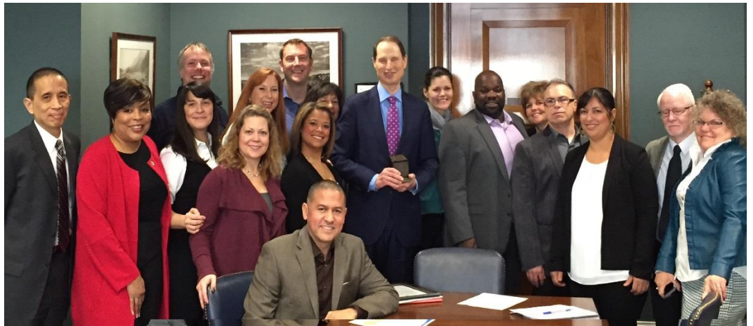
Senator Ron Wyden receives Workforce Champion Award from leaders of the Oregon Workforce Partnership