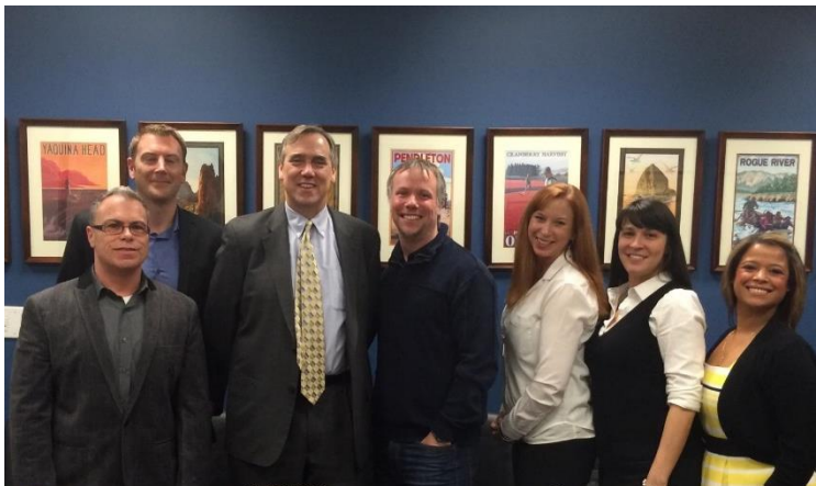
Senator Jeff Merkley meets with Oregon Workforce Partnership leaders